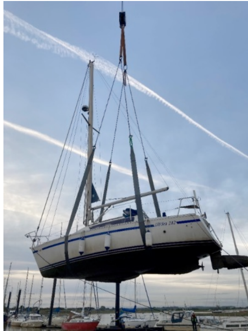
Crane out Burnham on Sea Oct 23