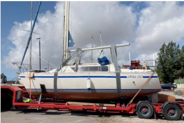
Launching Burnham on Sea Oct 24