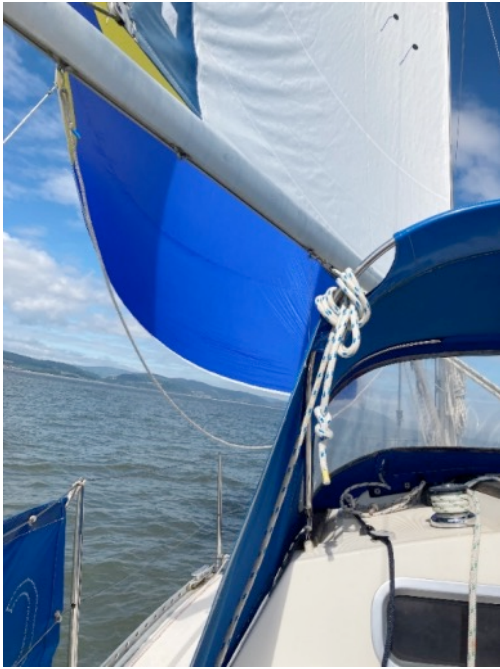
Cruising Ilfracombe Aug 23